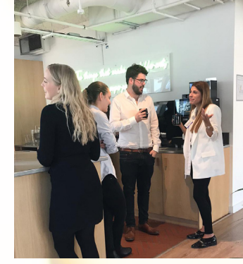
Entrants take a break – at MSD's offices in Moorgate

We were delighted to be able to return to a face-toface format for this year's event, and on Friday 6th May we welcomed our Best Newcomer entrants to MSD's fantastic offices in Moorgate, London.